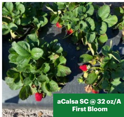
Neopestalotiopsis severity trial, Dover, FL, 2024